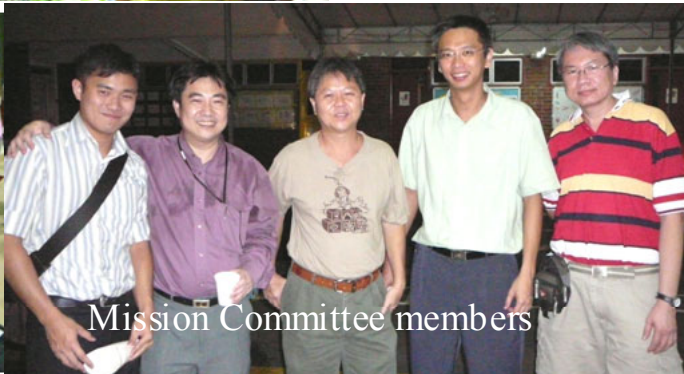
Mission Committee members